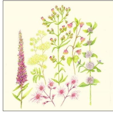
(C) wetland plants