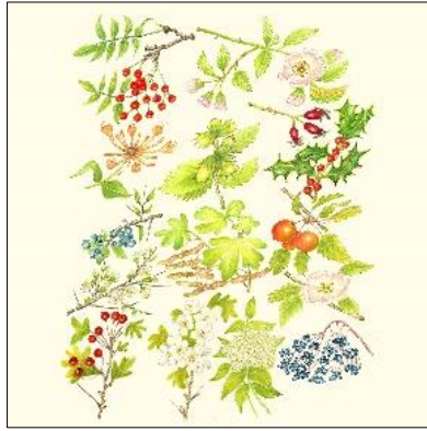
(B) trees and bushes